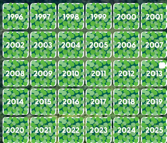
ANNUAL CUTTING PLOTS